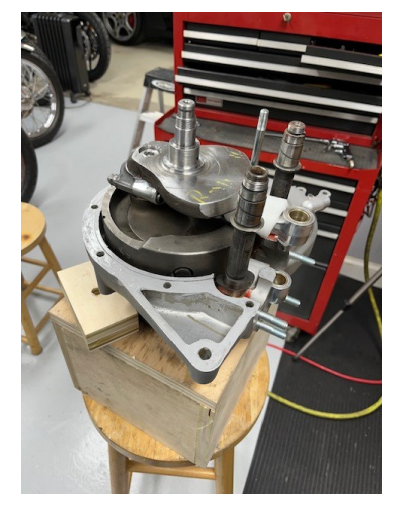
Preparing to install the cases