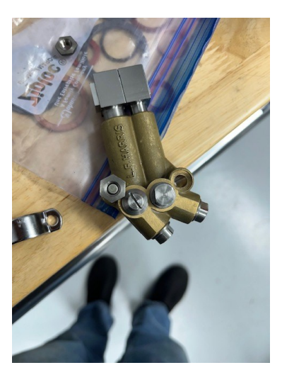
High Volume Oil Pump