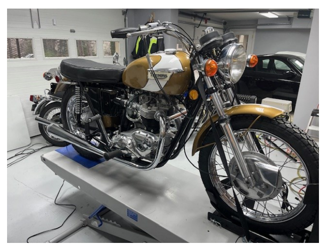
1972 Triumph Bonneville after complete rebuild