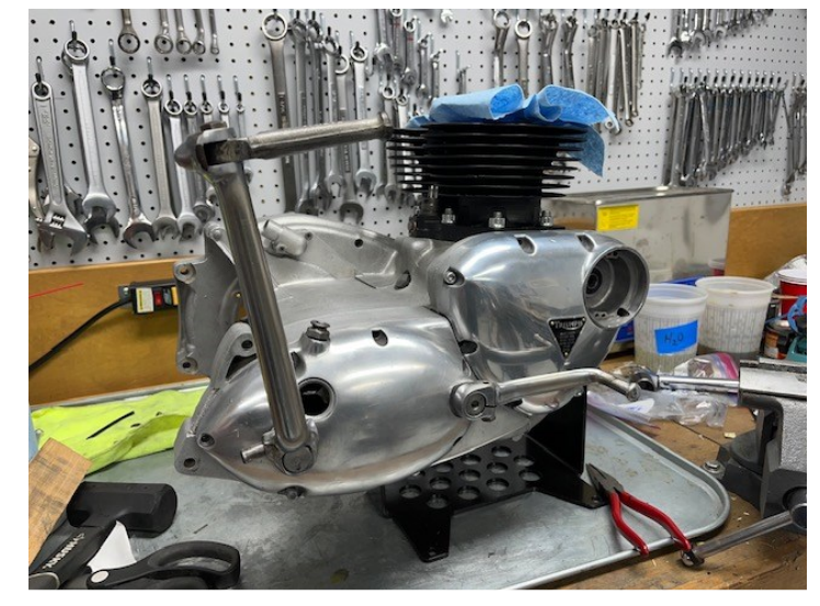
Gear Box installed