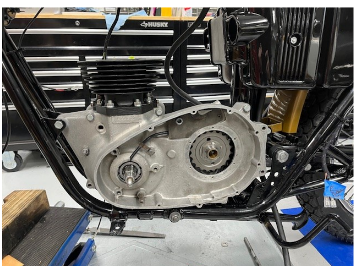
Engine installed in the frame