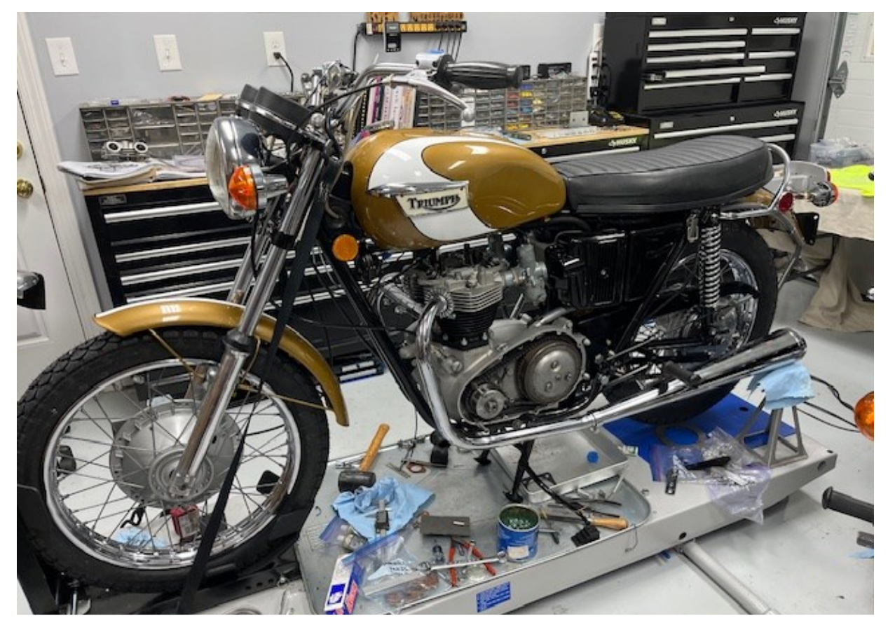
Carbs and exhaust Installed