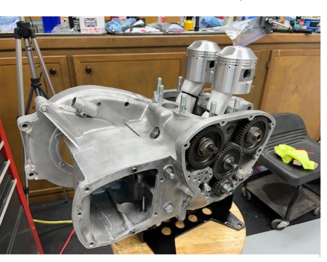
Cases Installed and timing set