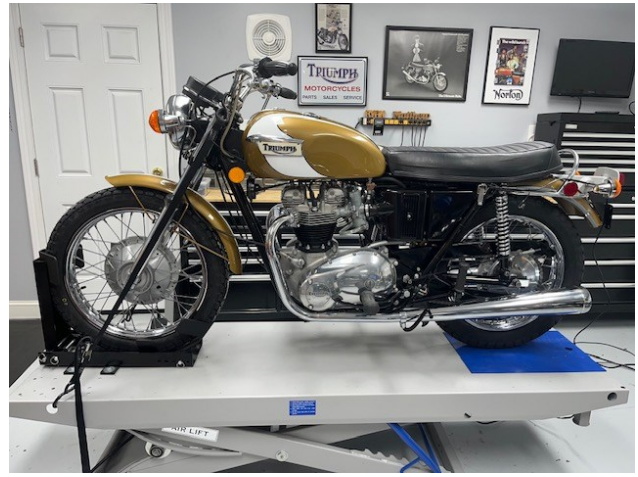
1972 Triumph Bonneville after complete rebuild