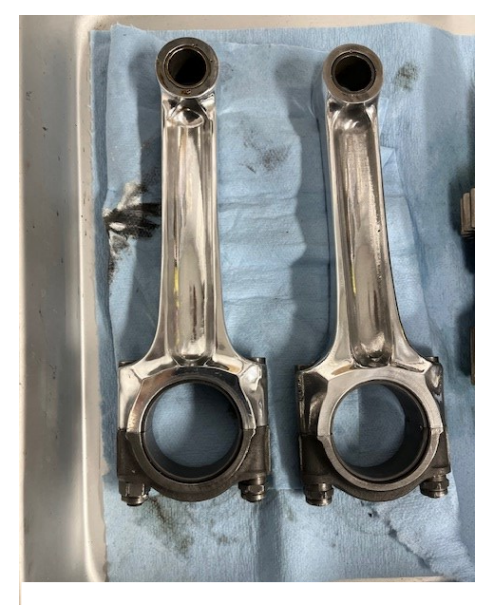
Connecting Rods Polished