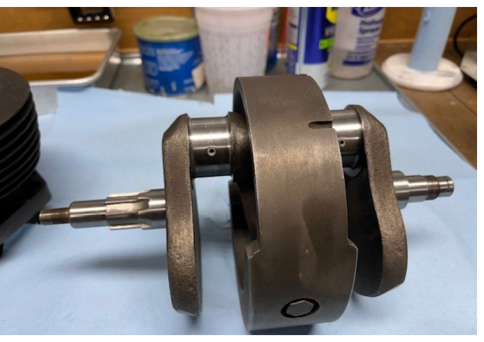
Crankshaft polished—New sludge trap installed