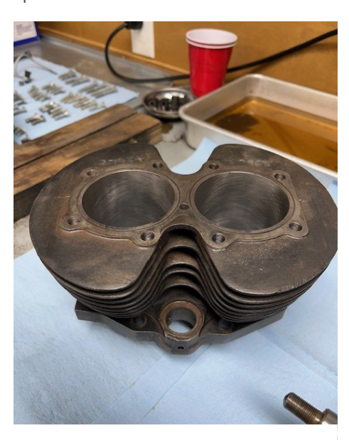
Cylinder bored to .020+