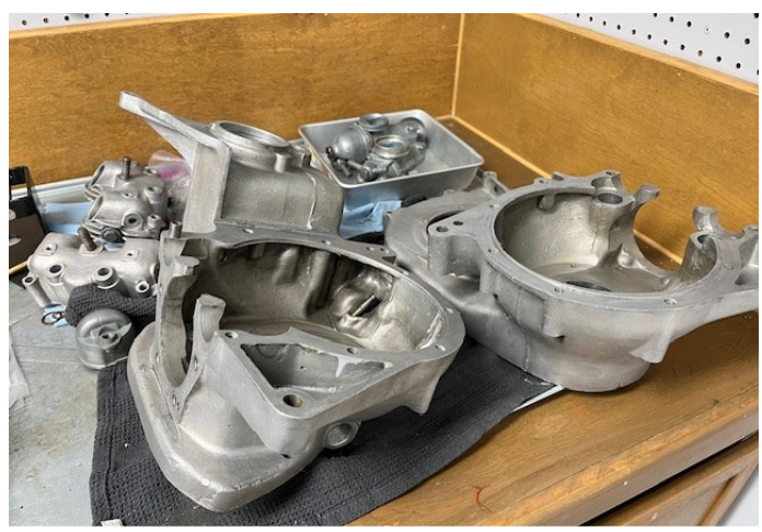
Cases Vapor Blasted and Cleaned