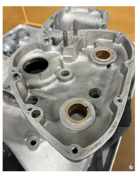
New Cam Bushes installed and reamed