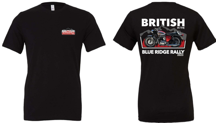
2023 Tee Shirt Design